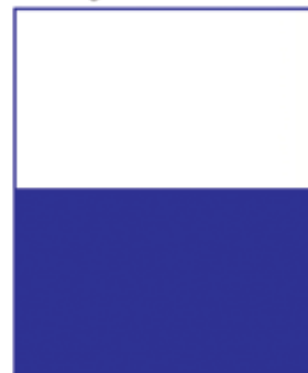
1/2 Page Horizontal

Horizontal: 4.625" x 5" Vertical: 2.18" x 10"