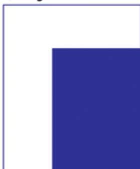
1/2 Page Vertical