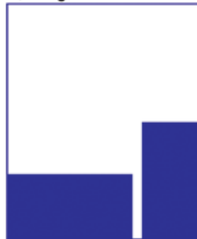
1/6 Page Horz. and Vert.

Horizontal – 4.625" x 5" Vertical – 2.18" x 5"