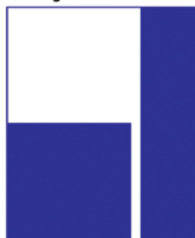
1/3 Page Horz. and Vert.

Horizontal: 4.625" x 5" Vertical: 2.18" x 10"