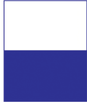
1/2 Page Horizontal

Horizontal: 4.625" x 5" Vertical: 2.18" x 10"